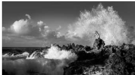
Ryan Sumner (47) Untitled