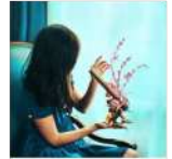
"Women are of course, no educated, but their minds are not educated for the higher sciences, philosophy and politics in the same manner as men are. The differences between men and women are in the same as between animal and plant." George White Friarish Hagi