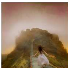
Late for Dinner

Raised in a family alongside four brothers and the absence of sisters, my eyes were opened by my daughter's growing up experiences from a girl to a teenager to a young woman. As a result, I am in awe of determined young women like my daughter who meet and negotiate both small daily hurdles and major life challenges. Their determination, empathy, and ingenuity in navigating a complex world make them heroines in my eyes.