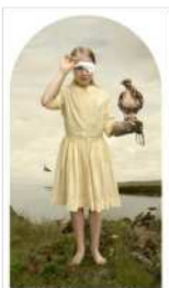
Hide Your Eyes