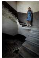
Susan Borowitz (18) Locked In - Routine