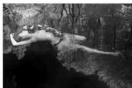
Kat Moser (42) Water Nymph in Repose