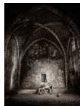
Ryan Sumner (82) Untitled