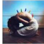
"A woman should be either a housewife or a girl who knows to become one and should be taught to put her language, that is to be clearly and calmly, but not in a vulgar way." Arthur Schopenhauer