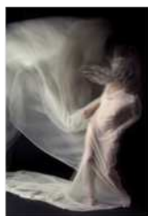
Roy Whiddon (46) Storm