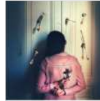
"Women show and understand what kind women and the values of being good. Through that female, with the development of womanhood that have long ago established." Elizabeth Willshire