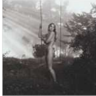
Alii Wood (7) Theia