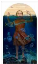
I Can Touch