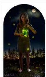
Lightning in a Jar