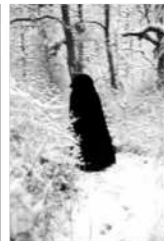
Vienne Rea (49) Scarlet Letter