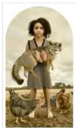
No You Don't