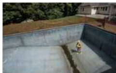
Susan Borowitz (18) Locked In - Deep End