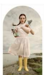
Tea For Two